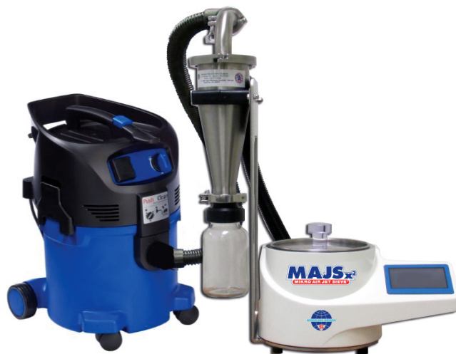
Standard MAJSx 2 "Basic" model setup with OPTIONAL Cyclone

While negative pressure airflow draws all the particles below a defined particle size down through a sieve screen, a positive airflow is introduced upwards through a rotating wand. This positive airflow deagglomerates and disperses the undersized particles allowing them to pass through the sieve screen to be collected.